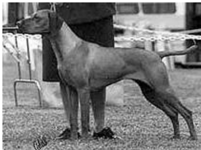
Ch Hanafor Lady Cavendish