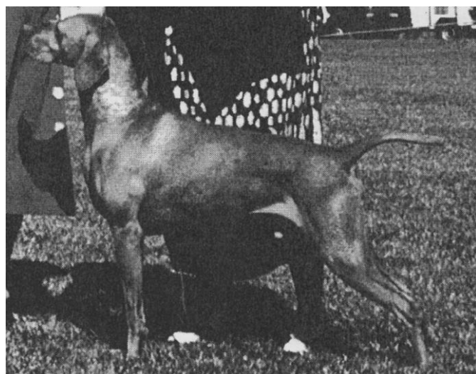
Ch Stubbs Red From Gardenway (IMP UK)