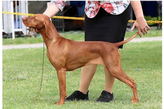
Ch Graebrook Colour Me Happy