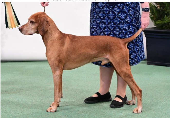
Sup Ch Dual Ch (T) Graebrook Kausin Kaos ET