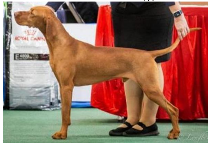
Ch Graebrook Rebel Withouta Cause