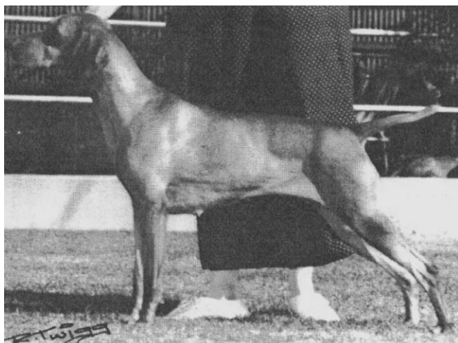
Ch Hanafor Lady Wychbold