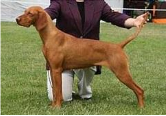
Ch Graebrook Breaking Point