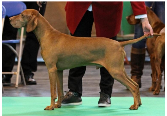
Ch UK Sh Ch Hanafor The Xecutioner