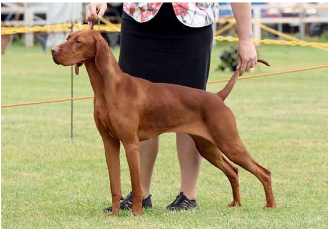
Graebrook Electric Mayhem