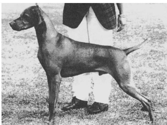
Gr Ch Hanafor Master Callaway