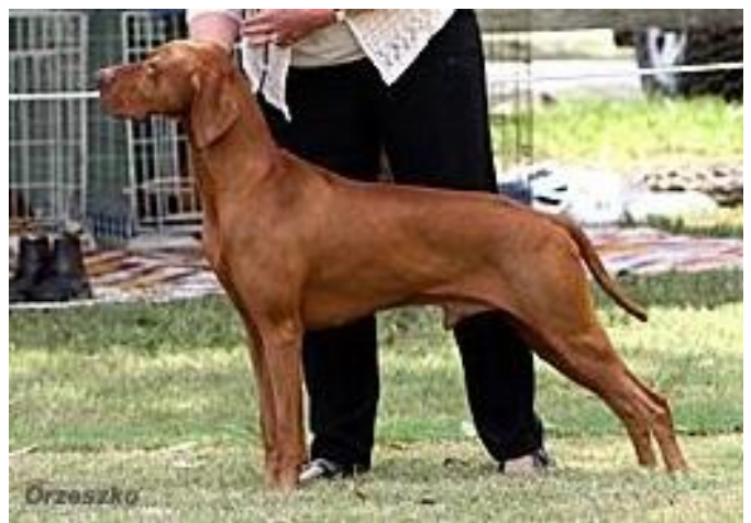
Sup Ch Hanabrit PontingThe Way (IMP UK)