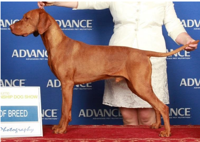
Sup Ch Graebrook Lord Of Scandal