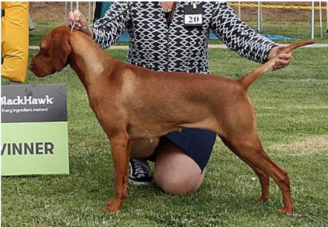
Ch Gamecall Making Waves