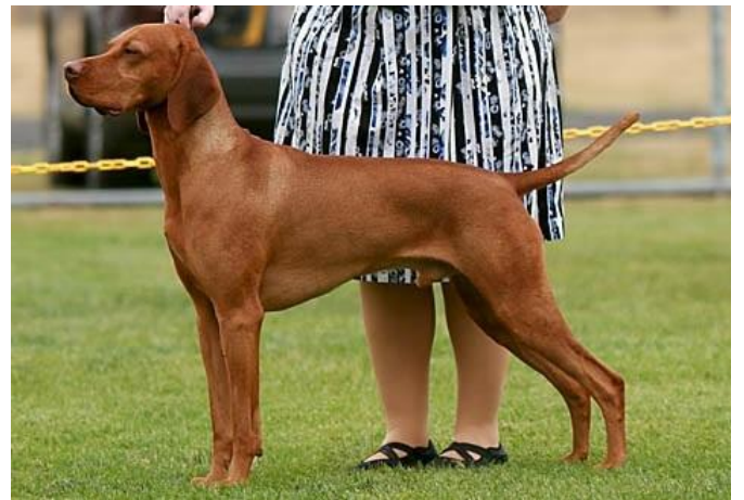
Sup Ch Graebrook Kausin Kaos TD ET