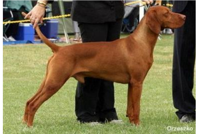
Ch Hungargunn Hyperno