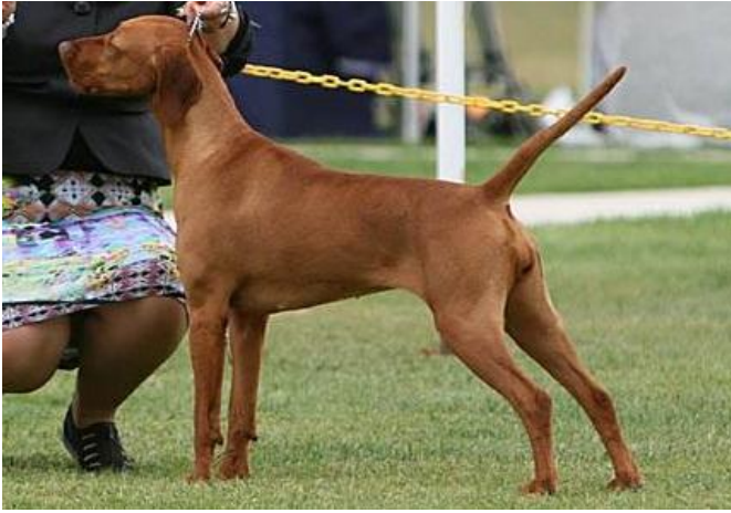
Ch Heiderst Scarlet Witch