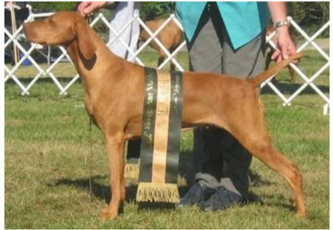
Ch Kimlise Isobella Ximenex