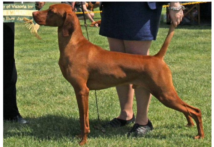
Ch Mastaregrand American Playboy (AI)