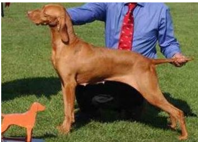
Ch Abbiestar Grand Marnier ET