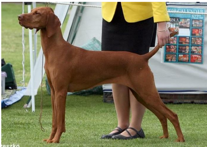
Gr Ch Graebrook Dzina Mzooni